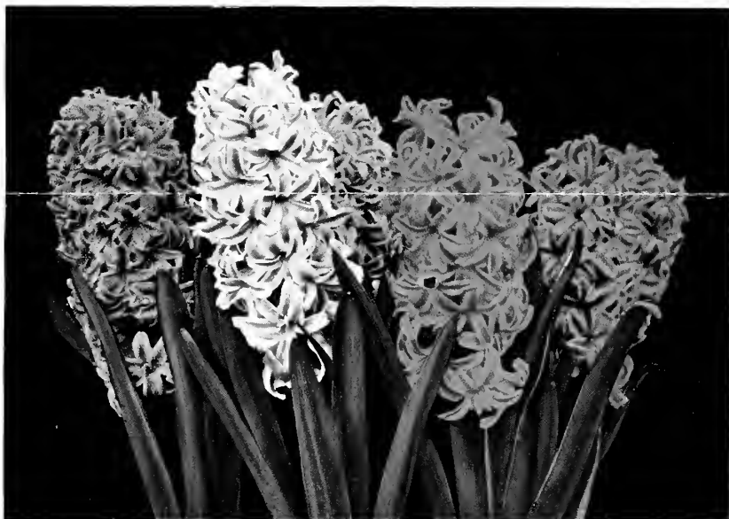
King-of-the-Blues L'Innocence Queen-of-the-Blues City of Haarlem LaVictoire Per doz., $1.25; per 100, $10.00; per 1000, $90.00

City of Haarlem. Large, strong truss of bright golden yellow flowers. There are only a few good yellow Hyacinths, and this is our choice among them.